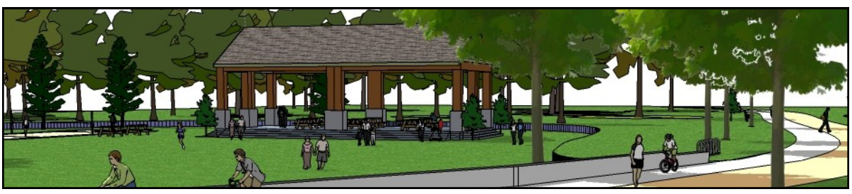
3d Illustration of Park Center