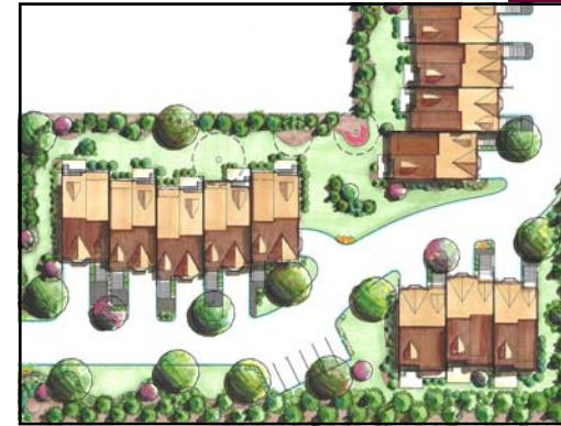
Concept Sketch of Town Center