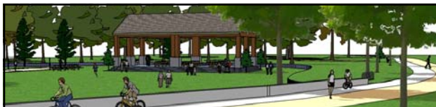
3D Illustration of Park Center