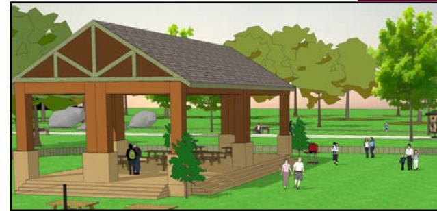
3d Illustration of Park Center