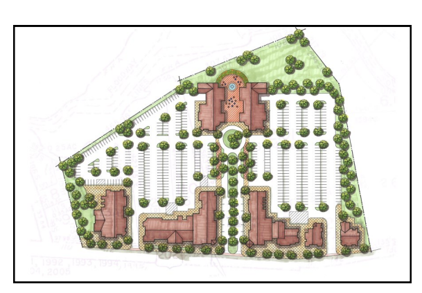
Conceptual Site Plan

As such, the Plan included several general planning goals that were based on an extensive compilation of background data, including existing land uses, environmental constraints, utility services, demographics, and recent development activity. Additional area-specific goals were also added to address the needs of distinct sections of the Township, including the Route 202 Corridor West, Towaco Center, Lake Valhalla, and the Route 46/Bloomfield Avenue Area.