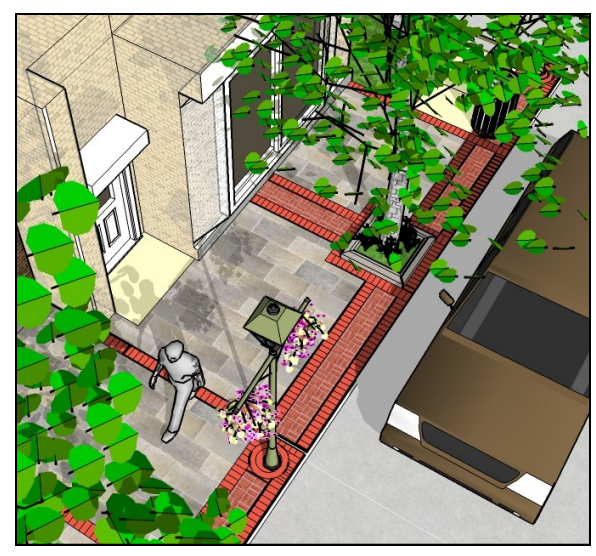
Streetscape Improvement Illustrations